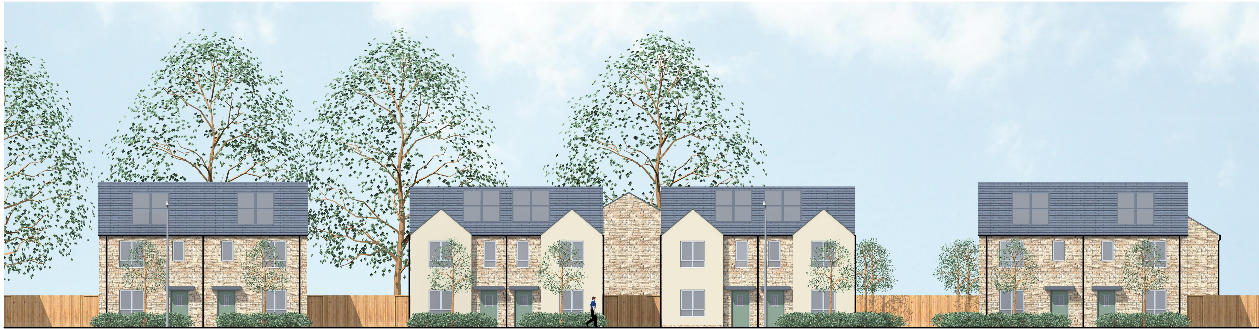
STREET ELEVATION PLOT NOS. 67-68 & 73-78