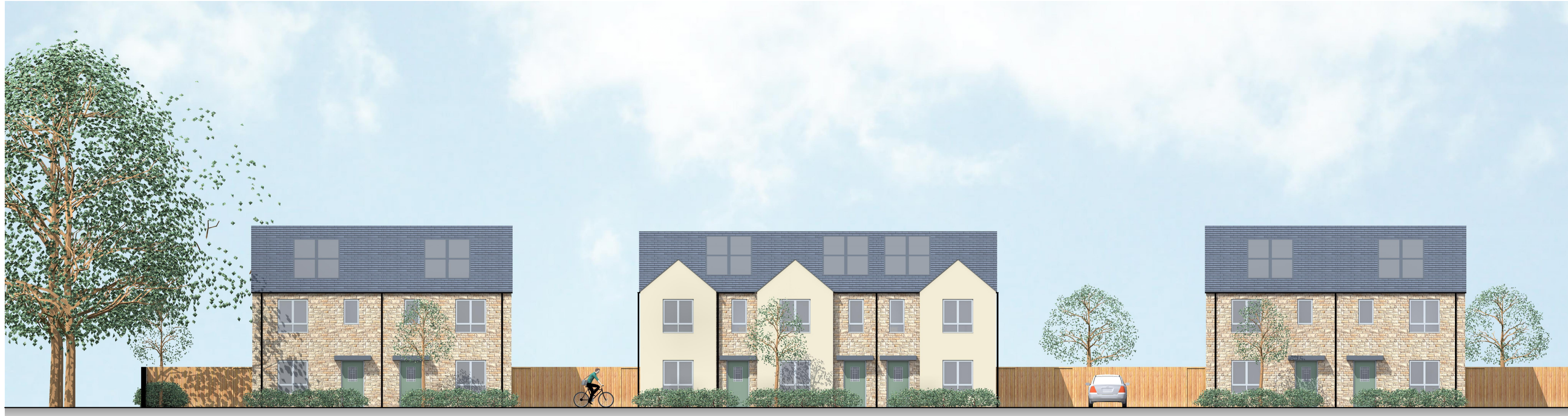
STREET ELEVATION PLOT NOS. 15-21