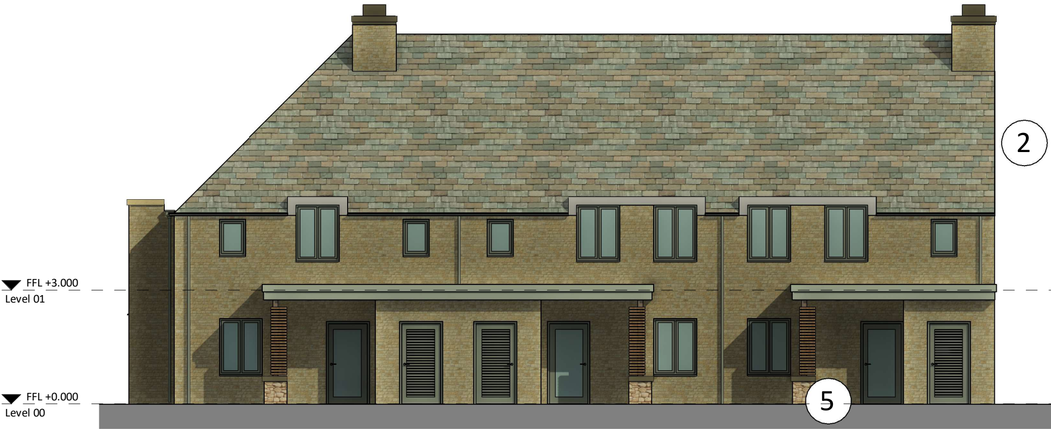
Elevation 3 1 : 100