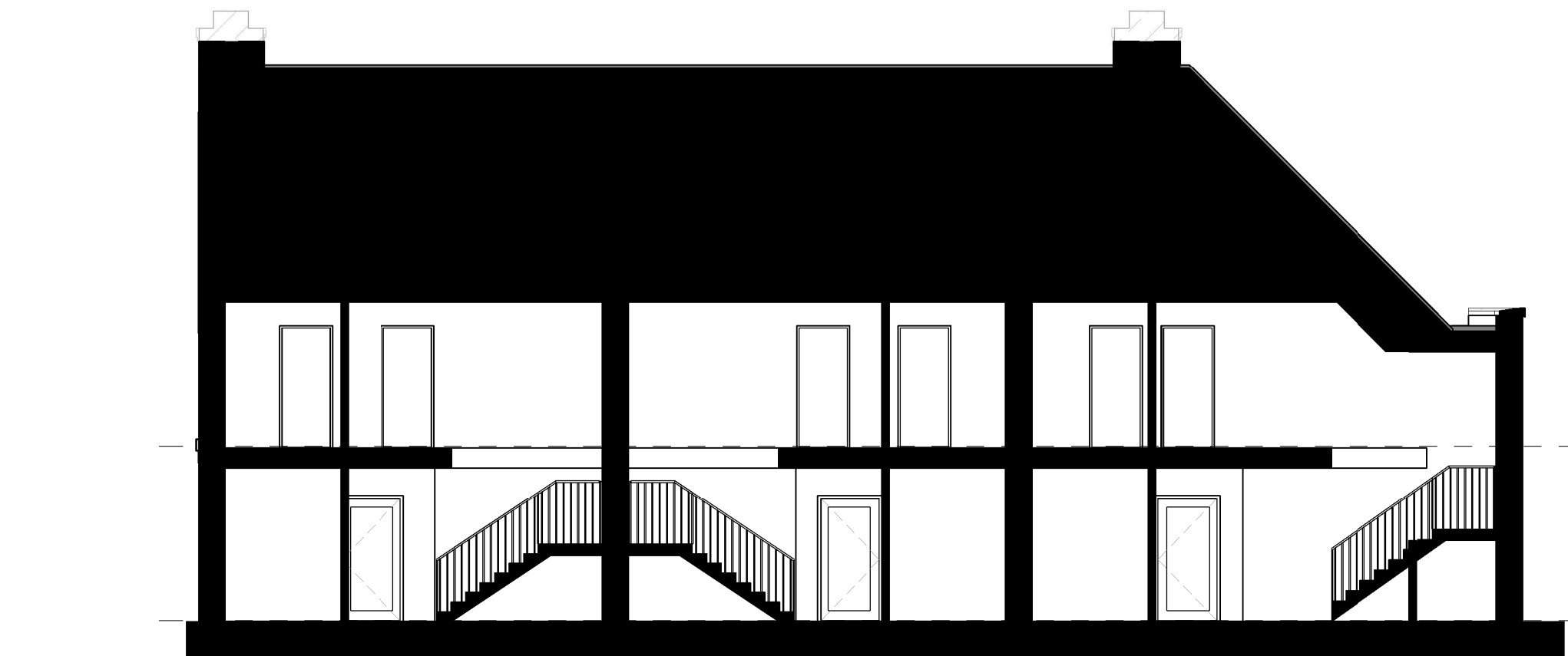
Section 1 1 : 100