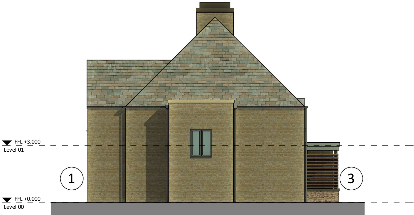
Elevation 4 1 : 100