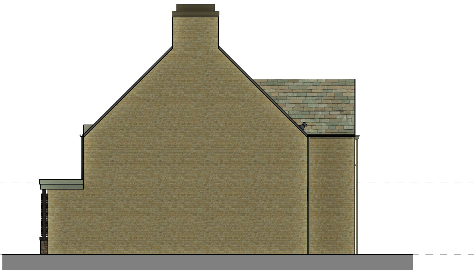
Elevation 2 1 : 100