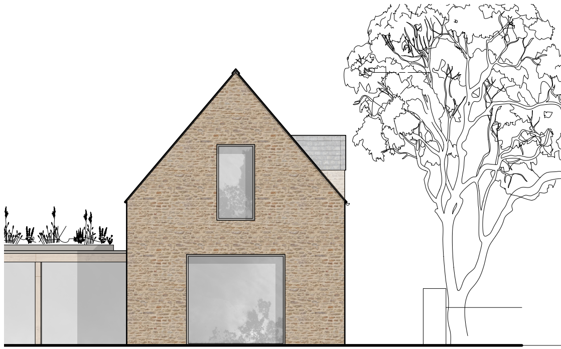
1 Bedrooms 1, 2 & 3 Gable Elevation Scale: 1:100