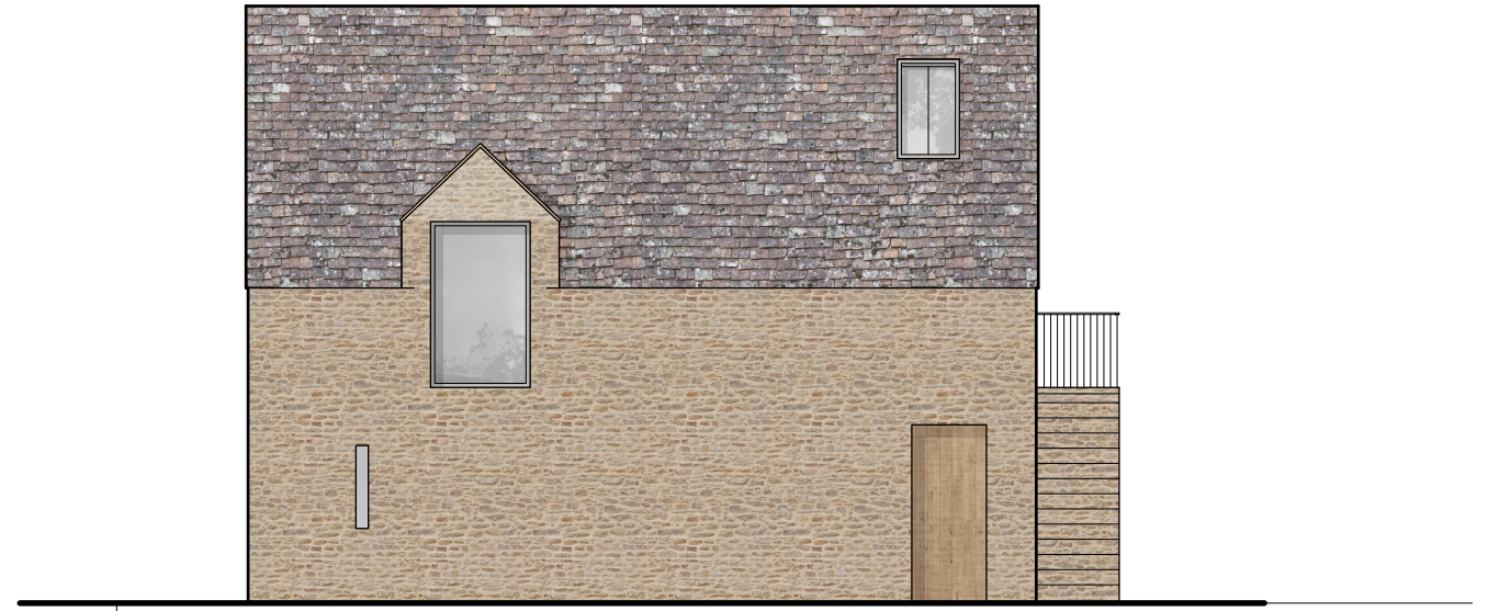
2 Bedrooms 1, 2 & 3 East Elevation Scale: 1:100