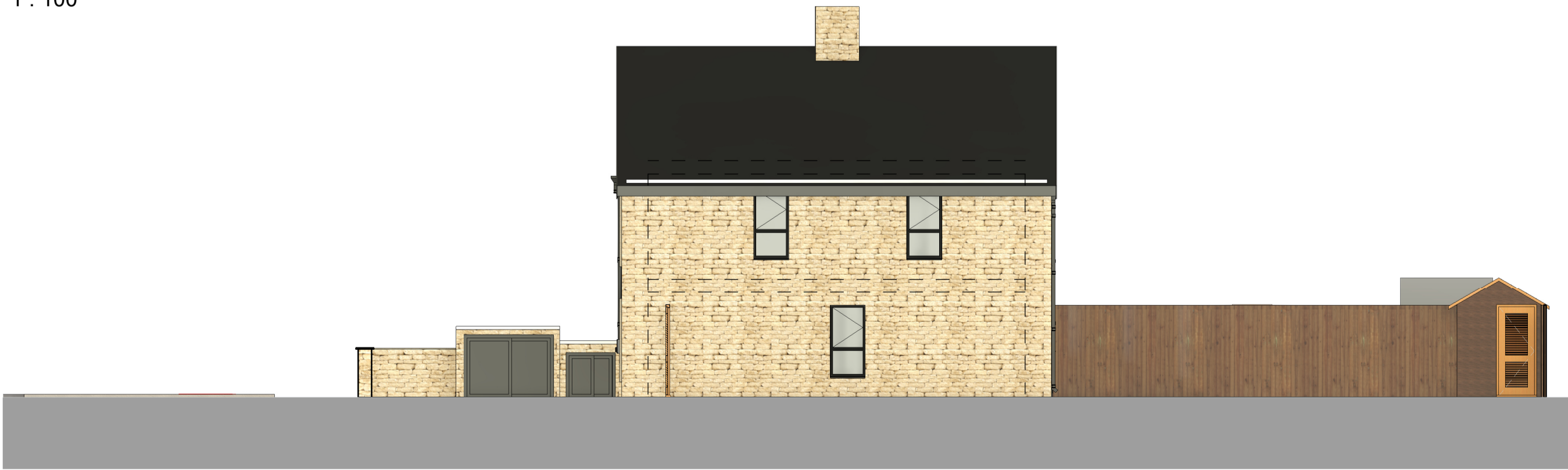
Proposed North Elevation - Side Elevation