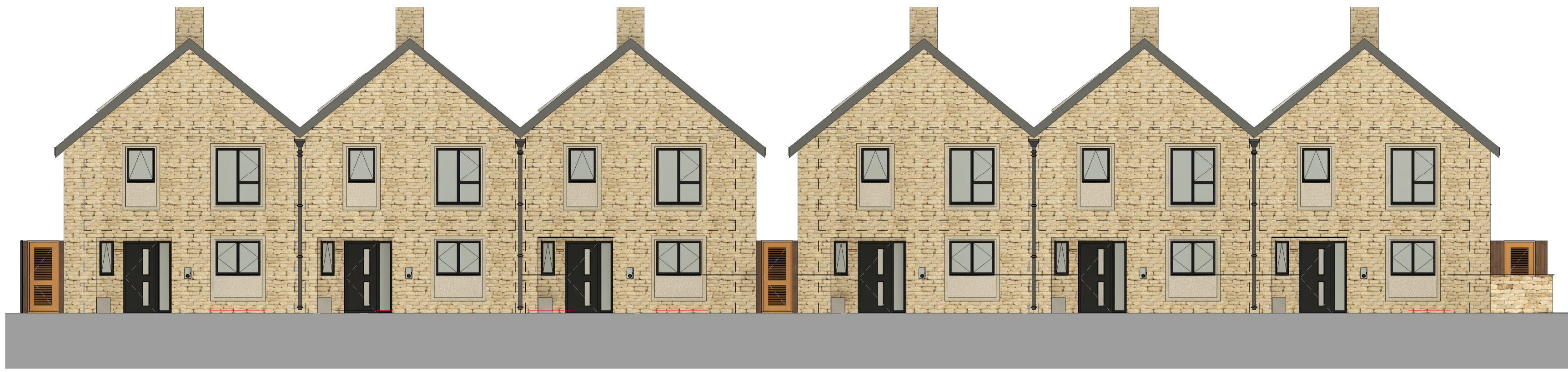
Proposed East Elevation - Front Elevation