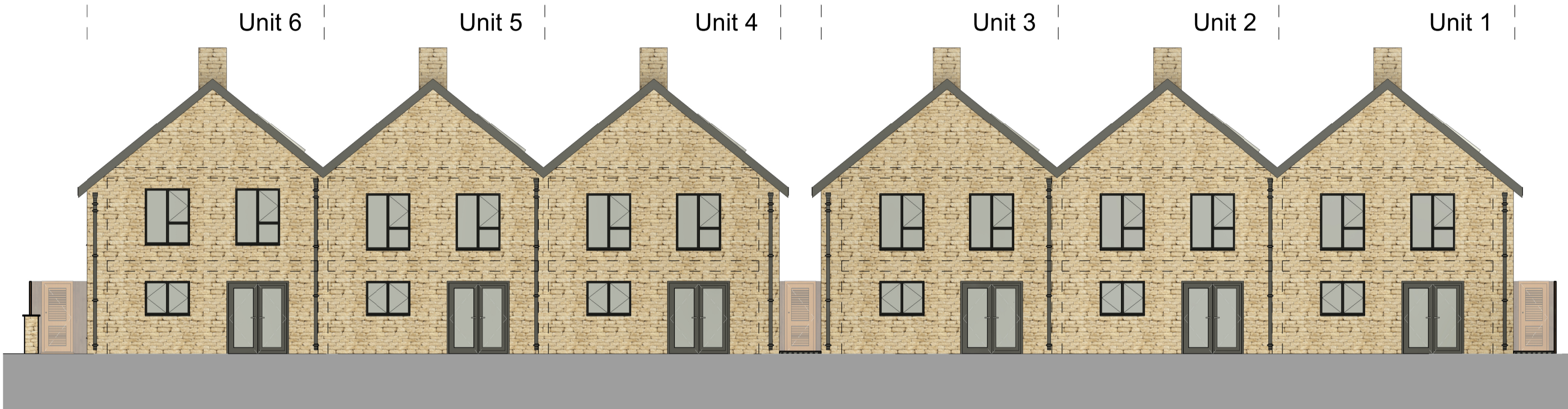
Proposed West Elevation - Back Elevation