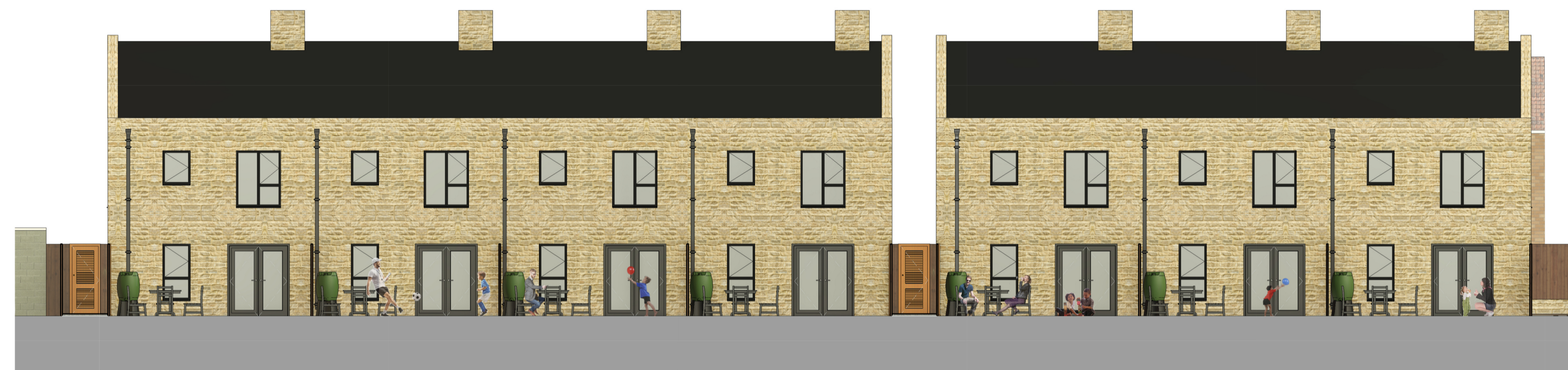
Proposed North Street Scene - Back Elevation 1 : 100