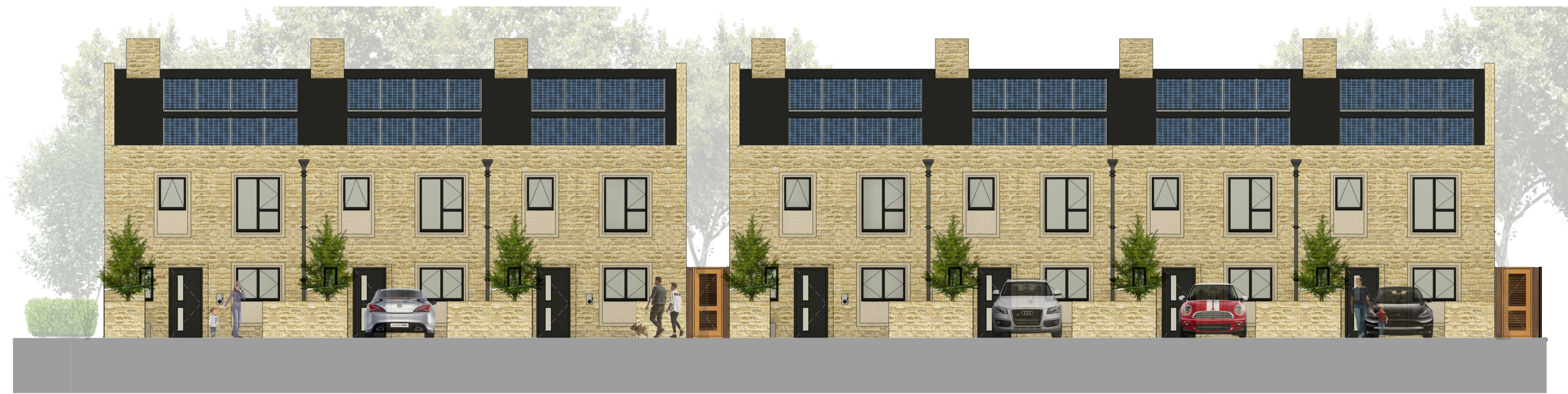
Proposed South Street Scene - Front Elevation 1 : 100