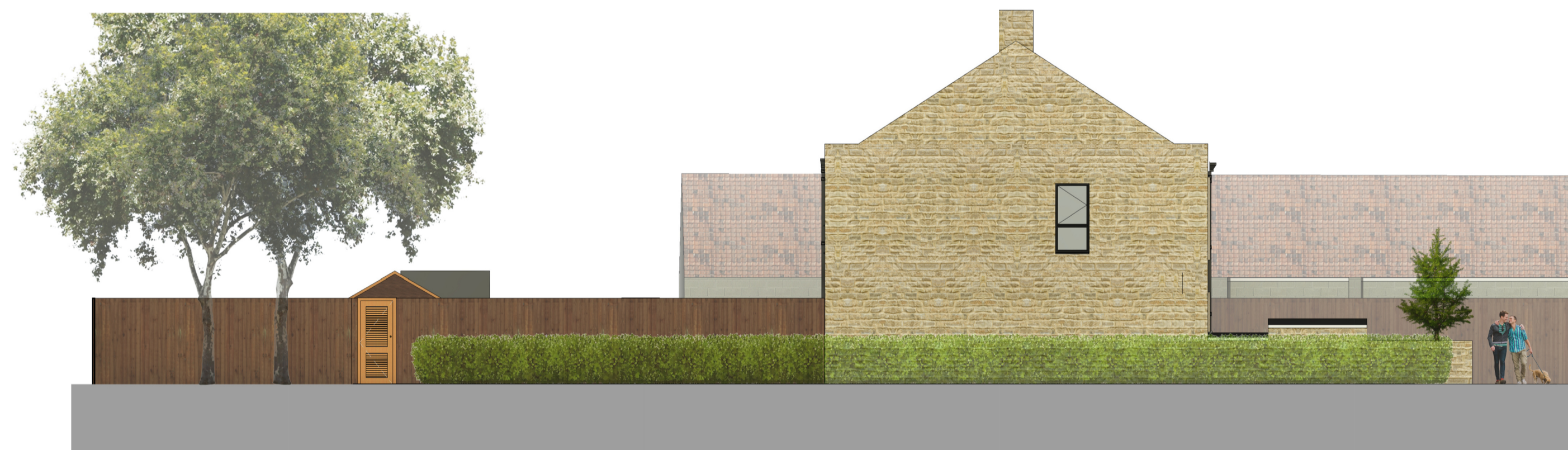
Proposed West Street Scene - Side Elevation 1 : 100