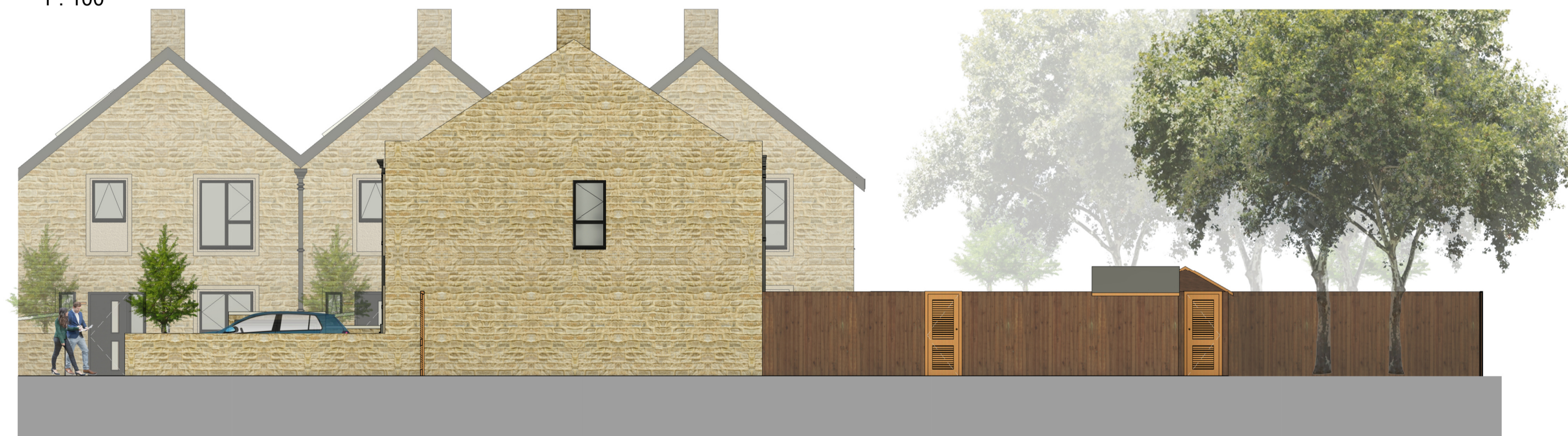
Proposed East Street Scene - Side Elevation 1 : 100