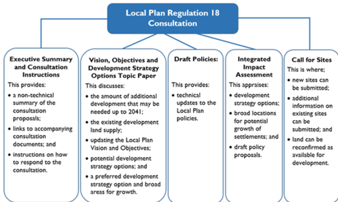
Diagram 2: The components of the Local Plan consultation.