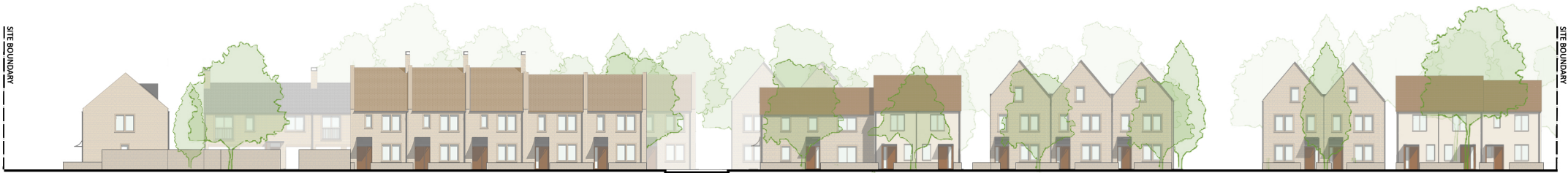
Street Scene A-A 1:500 @A3 London Rd

DO NOT SCALE FROM THIS DRAWING All dimensions to be checked on site prior to manufacture of prefabricated items. Any discrepancy or query to be reported and clarified before associated work proceeds. All construction to be in accordance with relevant Trade and Professional Standards and Guidelines, Statutory requirements and product manufacturers' specifications. Read in conjunction with Finishing specification, Workmanship specification, all other associated drawings issued and details which may be issued from time to time.