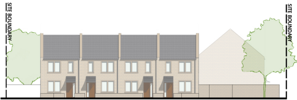
Street Scene B-B 1:500 @A3 Northfield Rd