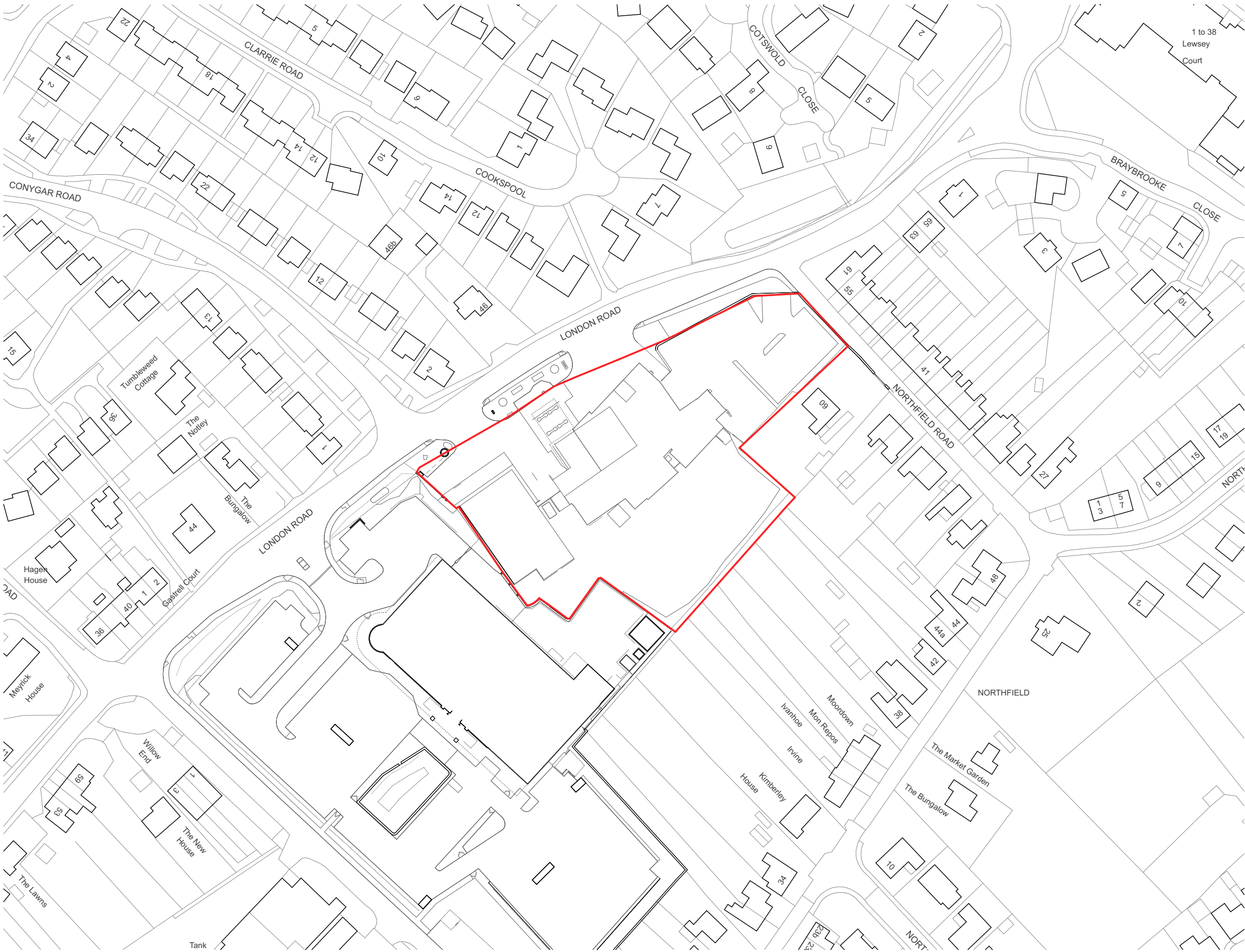
1521.E.001 Site Location Plan 1:1250@A3

This drawing has been produced for Newland Homes for the proposed development at London Road, Tetbury and is not intended for use by any other person or for any other purpose.