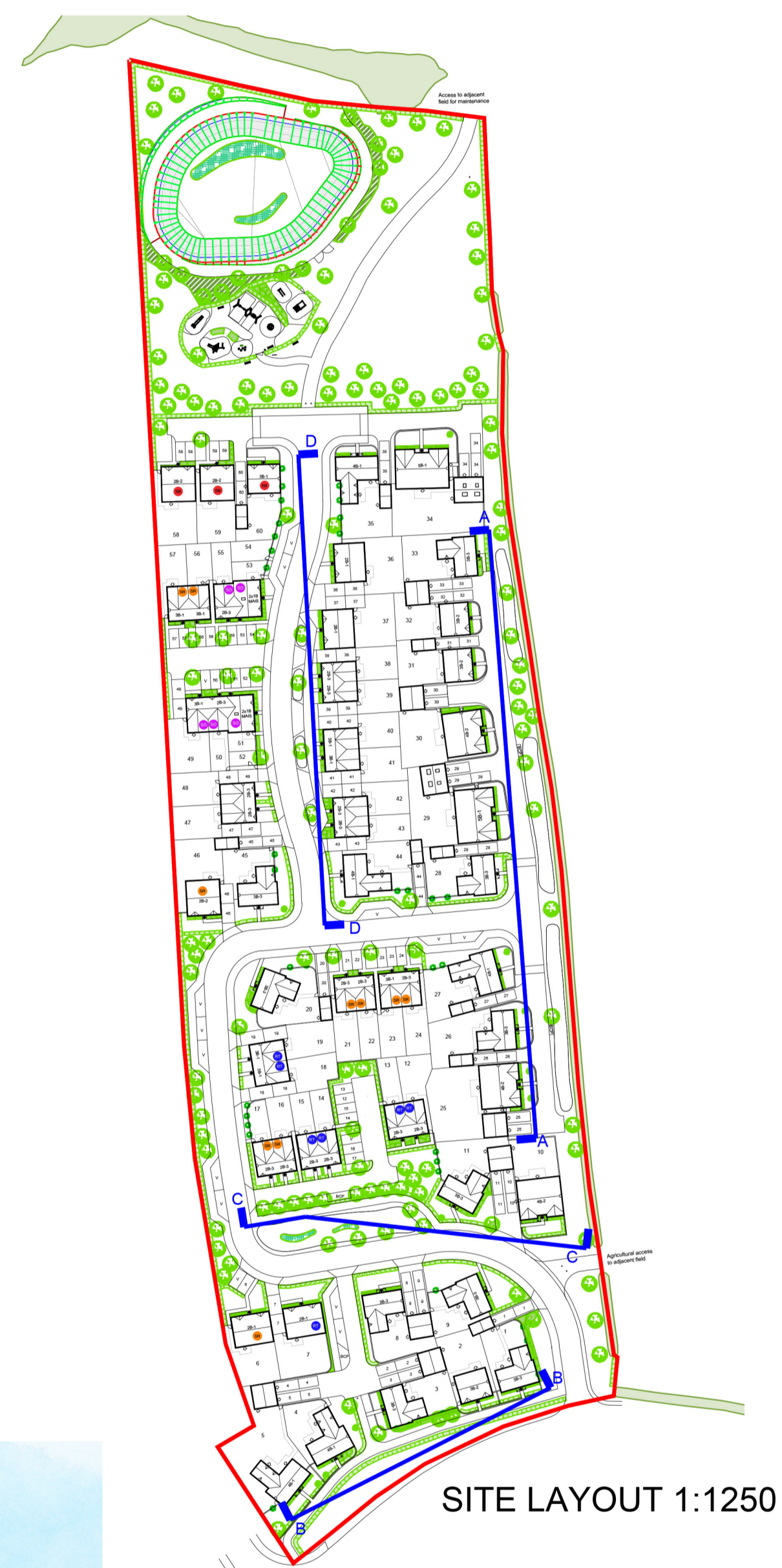
SITE LAYOUT 1:1250