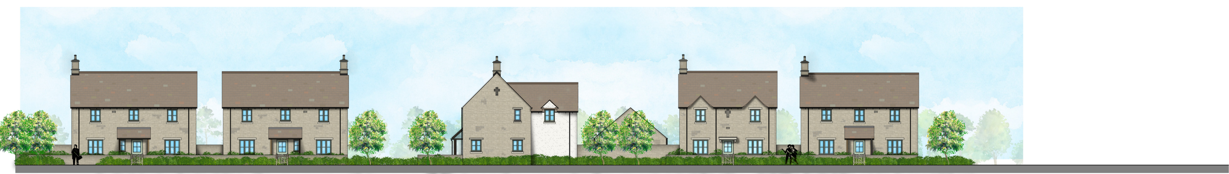
STREET SCENE B-B