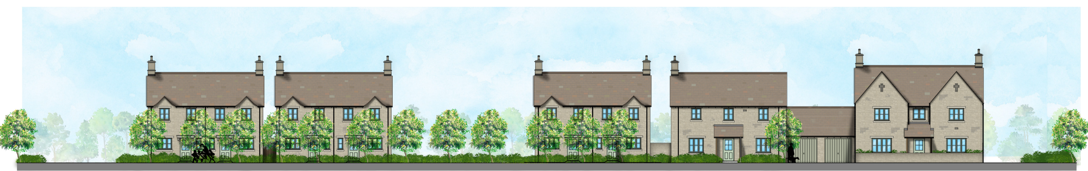
STREET SCENE C-C