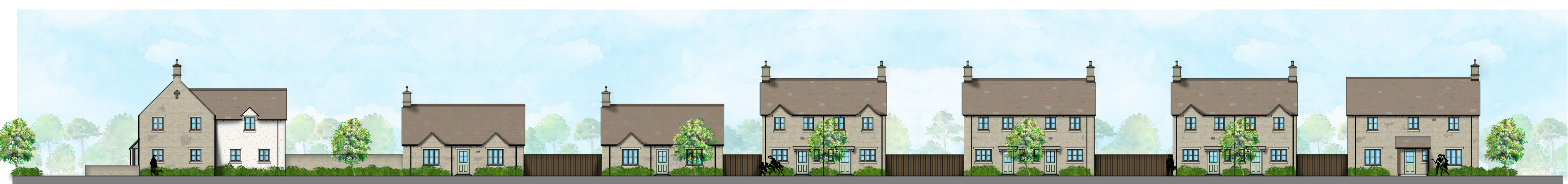
STREET SCENE D-D