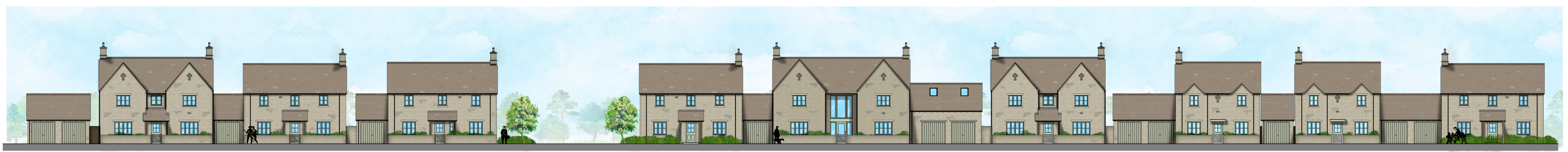
STREET SCENE A-A