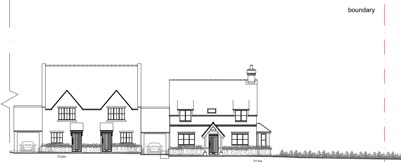
SECTION S1 Continued