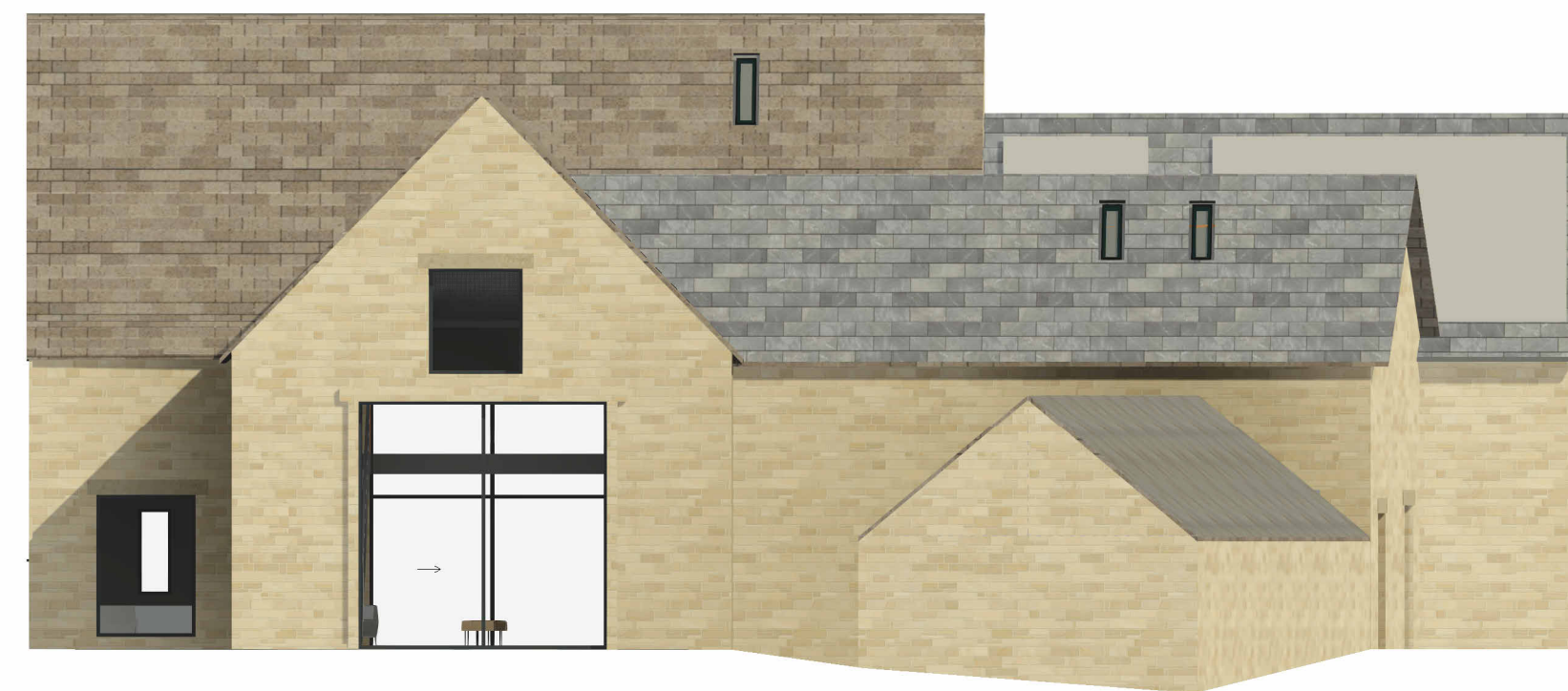
3 | EL - ZZ - Proposed South Elevation 1 : 100