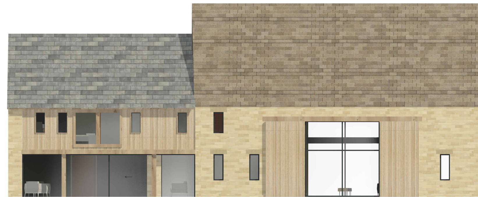
2 | EL - ZZ - Proposed North Elevation 1 : 100