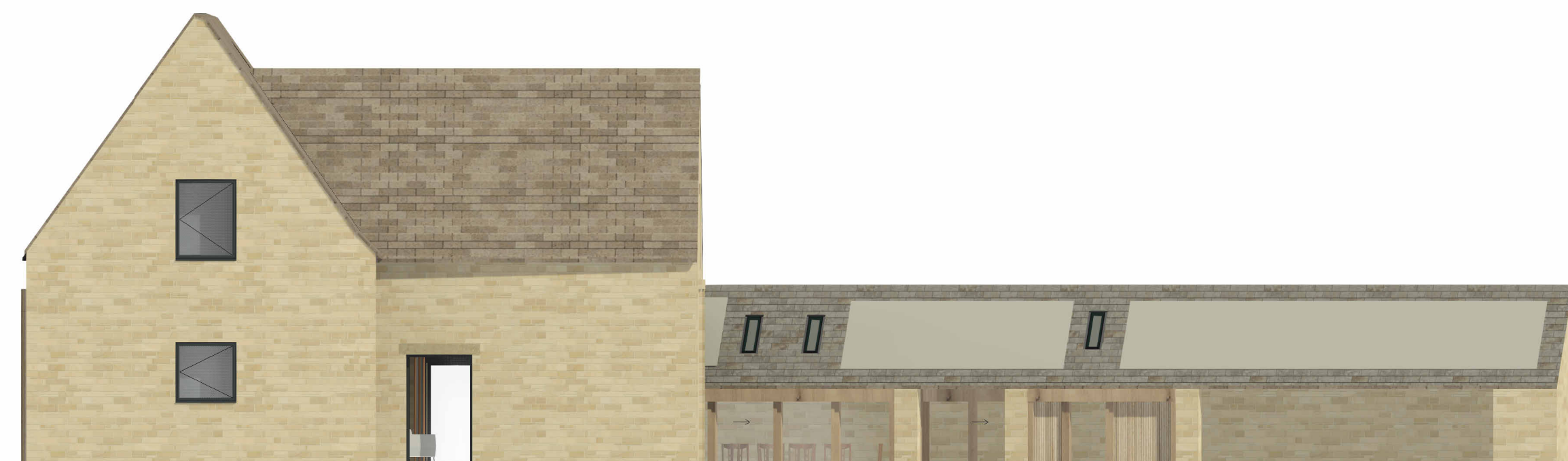
4 | EL - ZZ - Proposed West Elevation 1 : 100