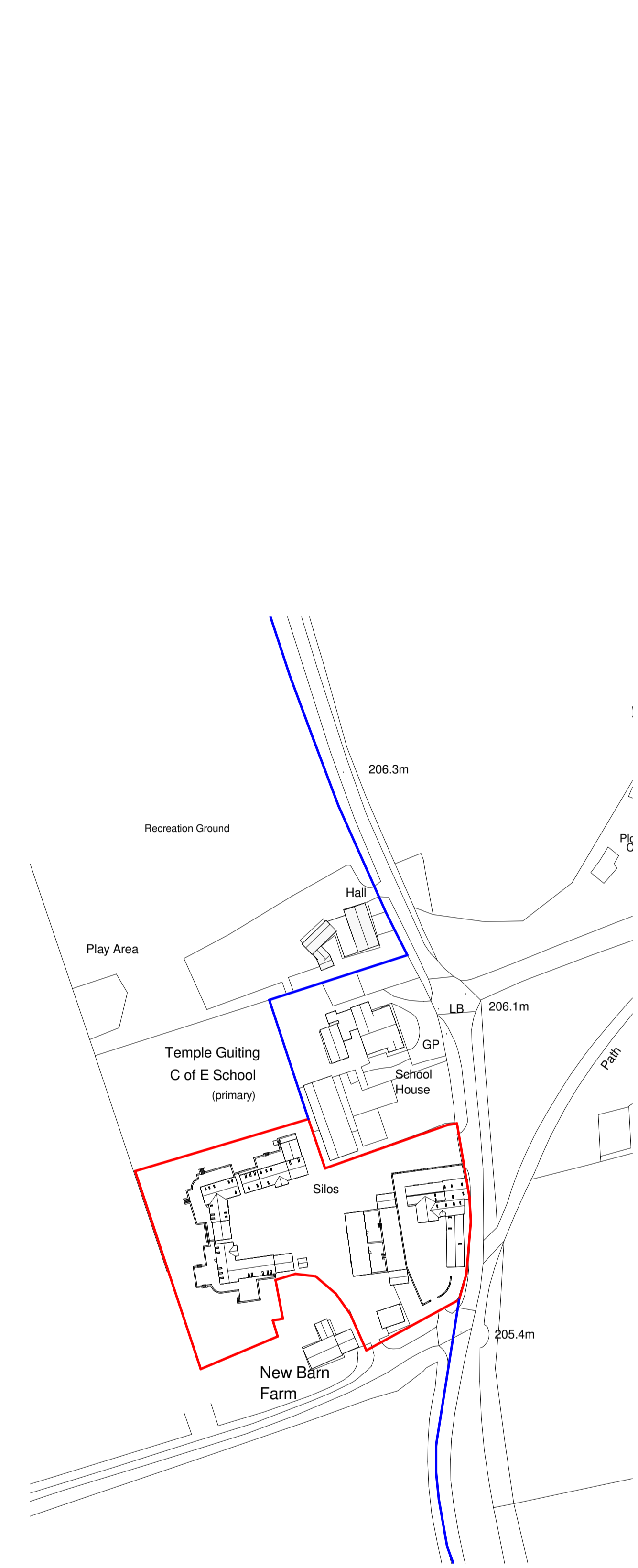
1 | SI - ZZ - Proposed Site Location Plan 1 : 1250