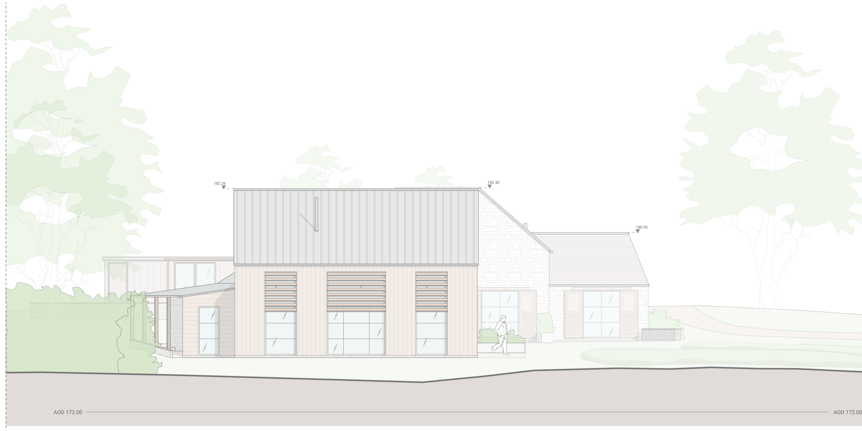
PREVIOUSLY SUBMITTED NORTH ELEVATION B